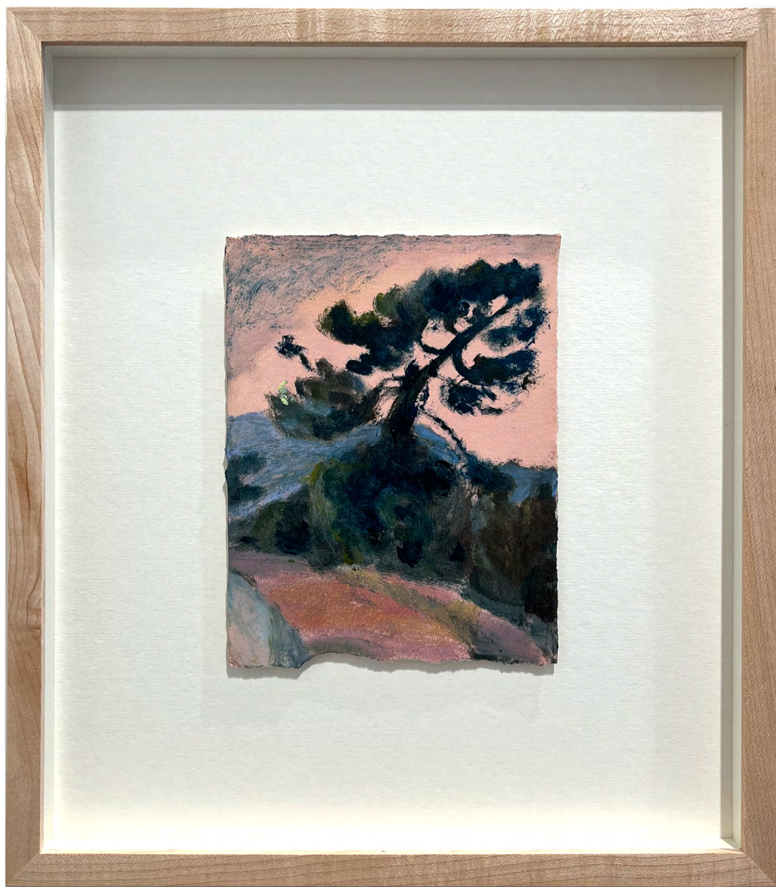
Along the Coast Pastel on paper 13 x 17 cm - unframed size 30 x 34 cm - framed size 2022 Framed in maple SOLD