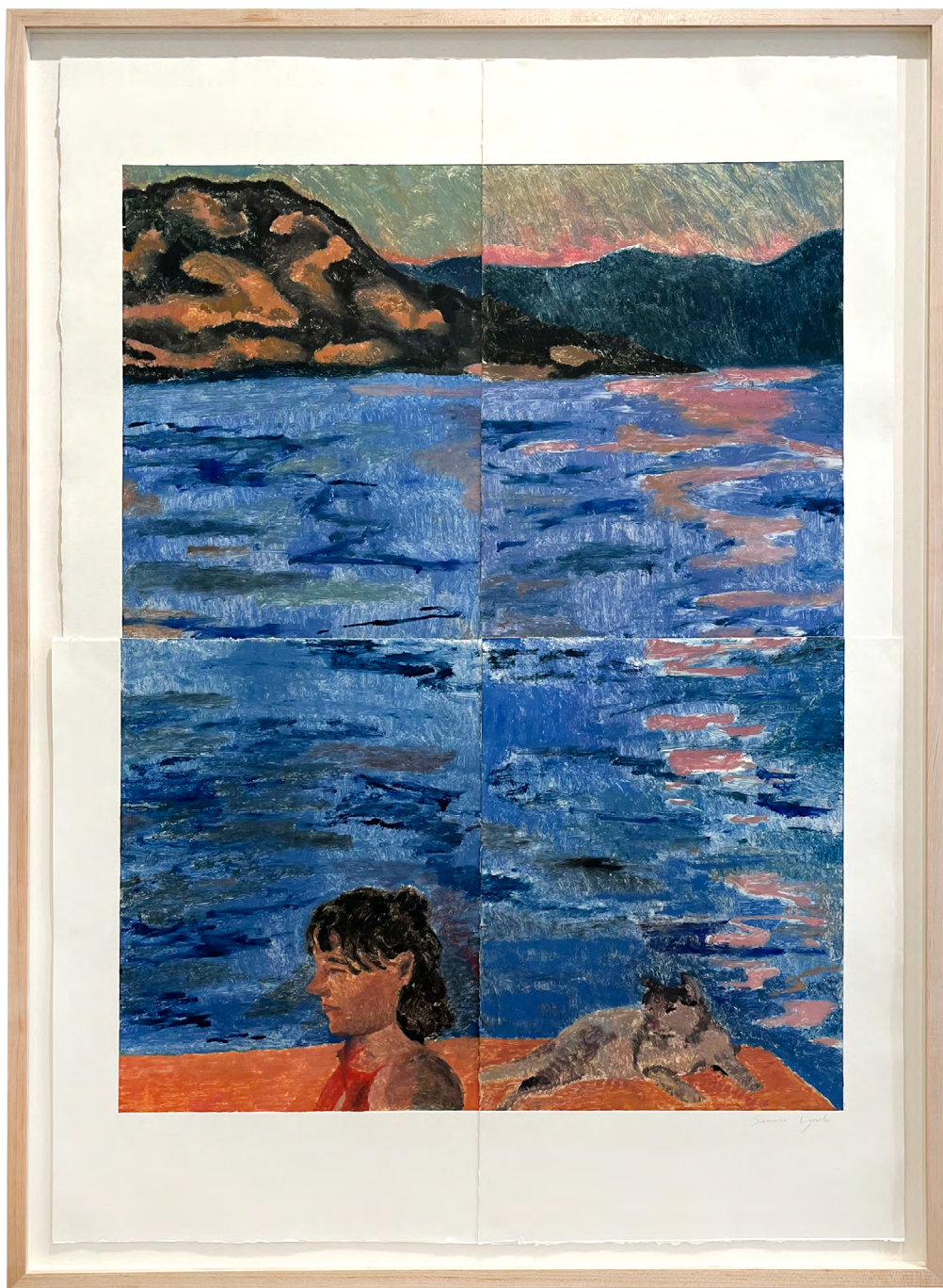
Keeping Afloat Monotype on Hahnemuhle paper 93 x 131 cm - unframed size 102 x 141cm - framed size 2022 Framed in maple £3,600