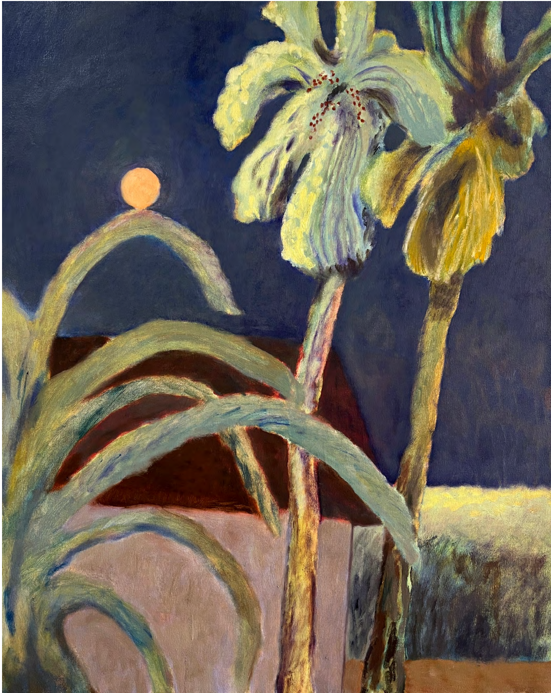
Palms at Night Oil on canvas 70 x 100 cm 2023 £2,700