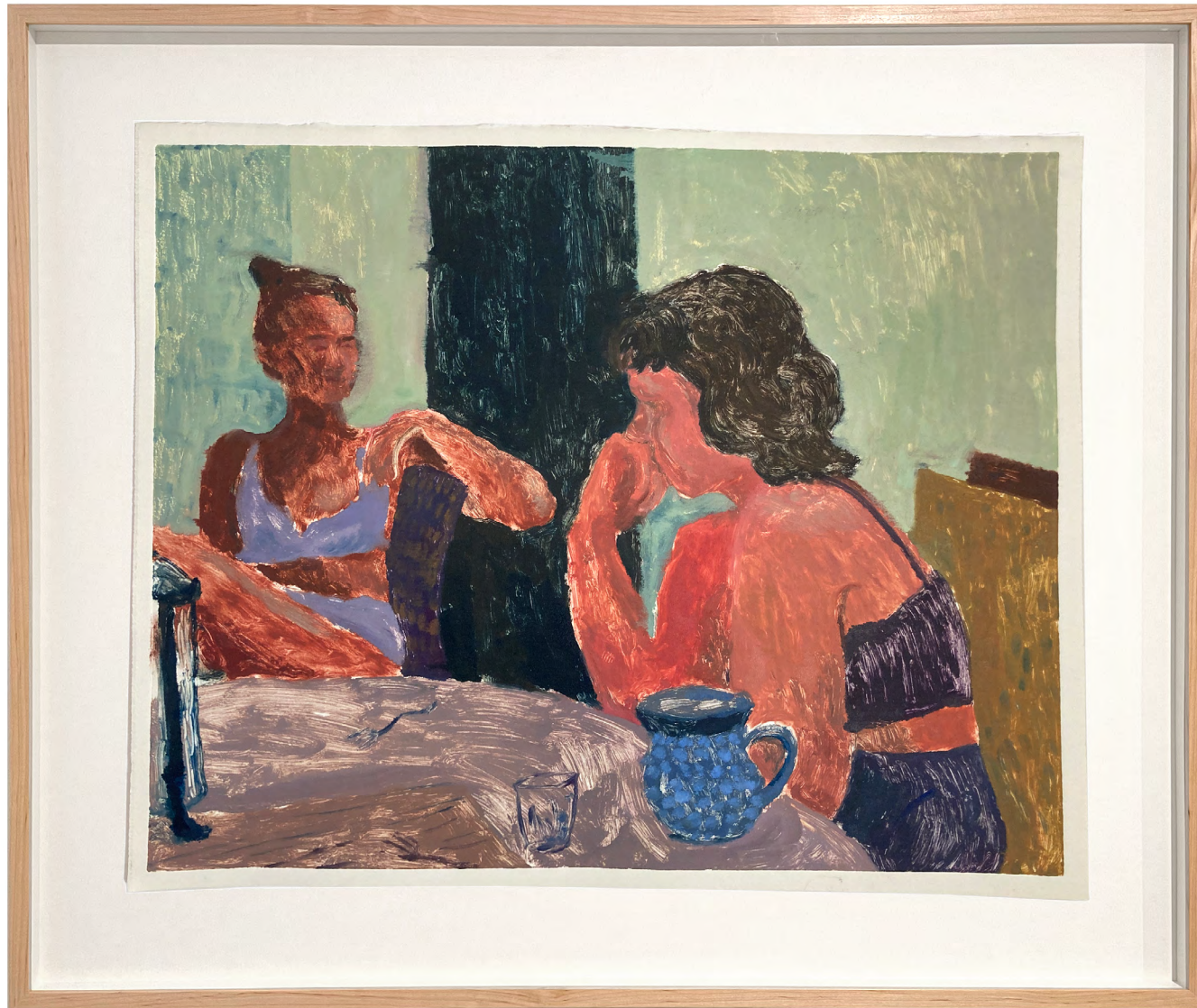
Taking Care Monotype on Hahnemuhle paper 65 x 52 cm - unframed size 82 x 68 cm - framed size 2023 Framed in maple £950