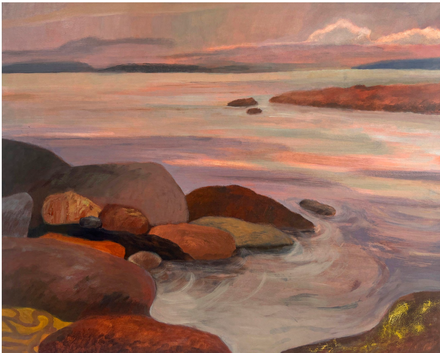
All Things Pass Oil on canvas 120 x 150 cm 2023 SOLD