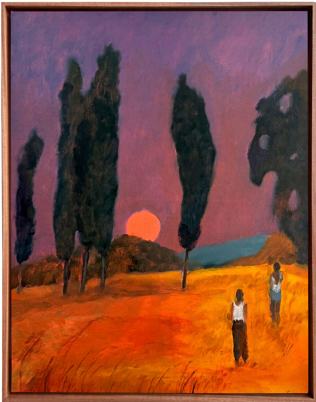
Red Moon Rising Oil on canvas 72 x 92 cm 2023 Framed in sapele SOLD