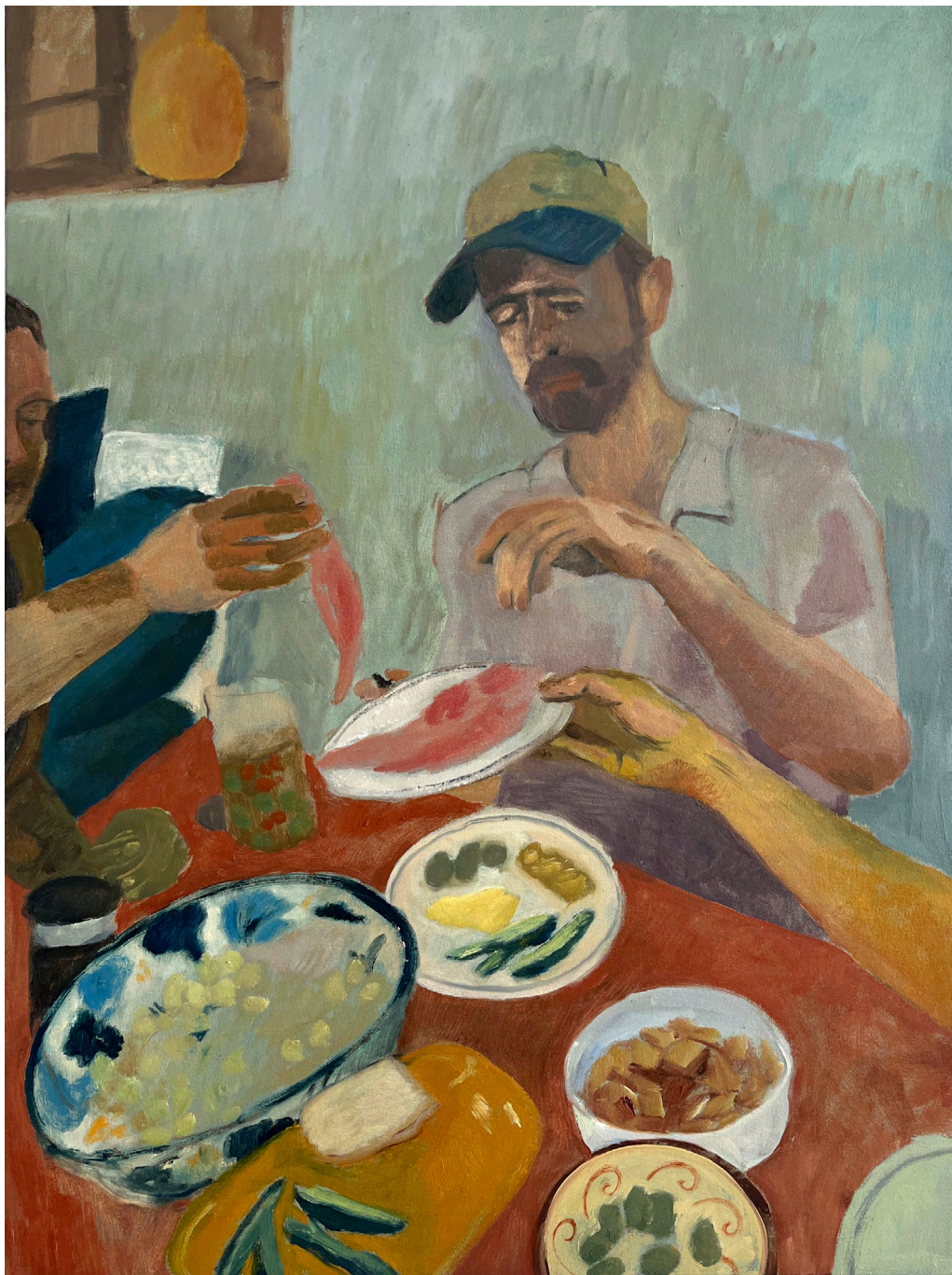
Aaron at the Table Oil on canvas 76 x 102 cm 2023 £2,600