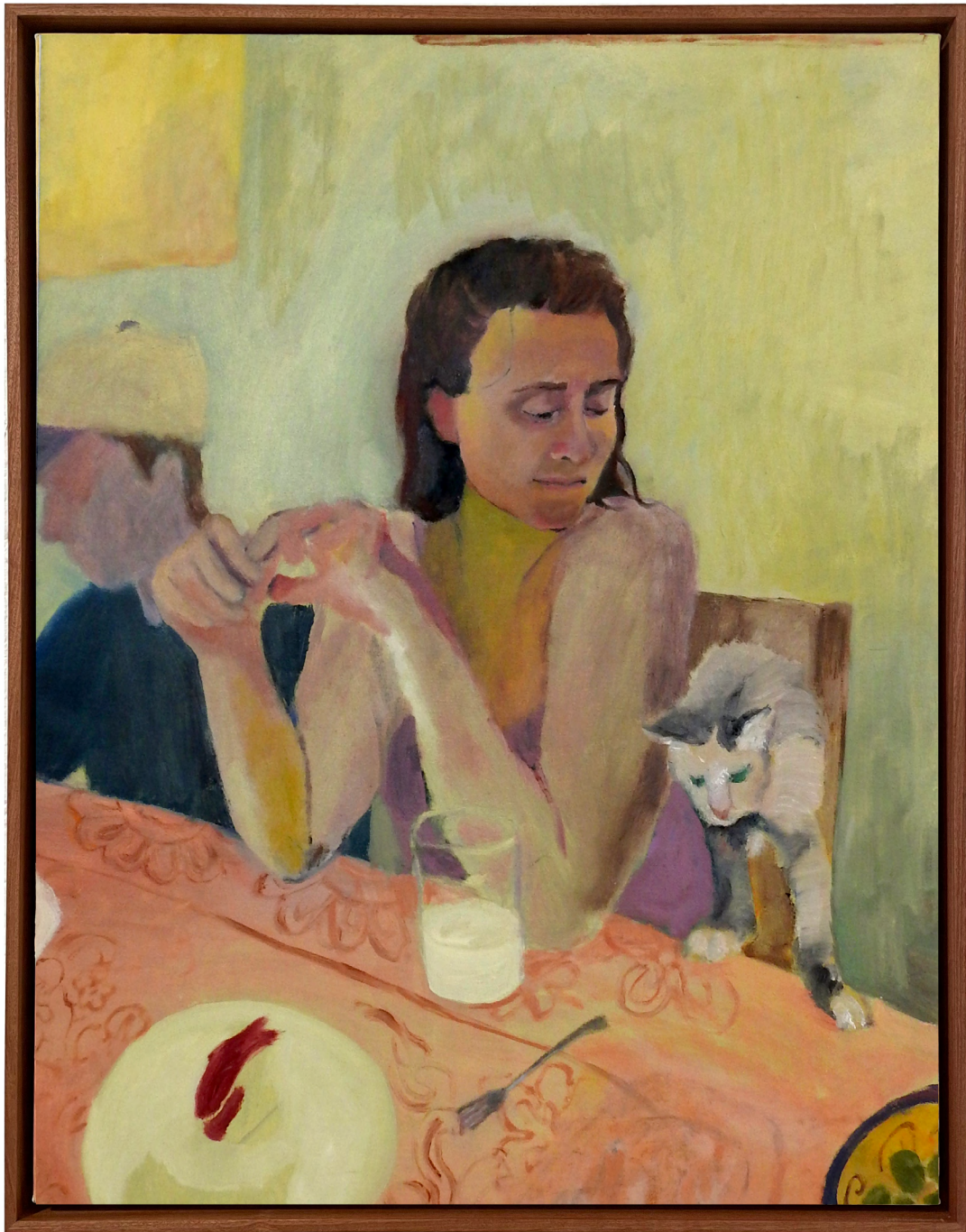
Delicate Creatures Oil on canvas 72 x 92 cm 2023 Framed in sapele £2,900