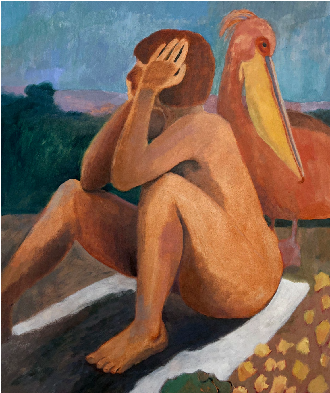
The Pelican Oil on canvas 91 x 107 cm 2023 £3,200