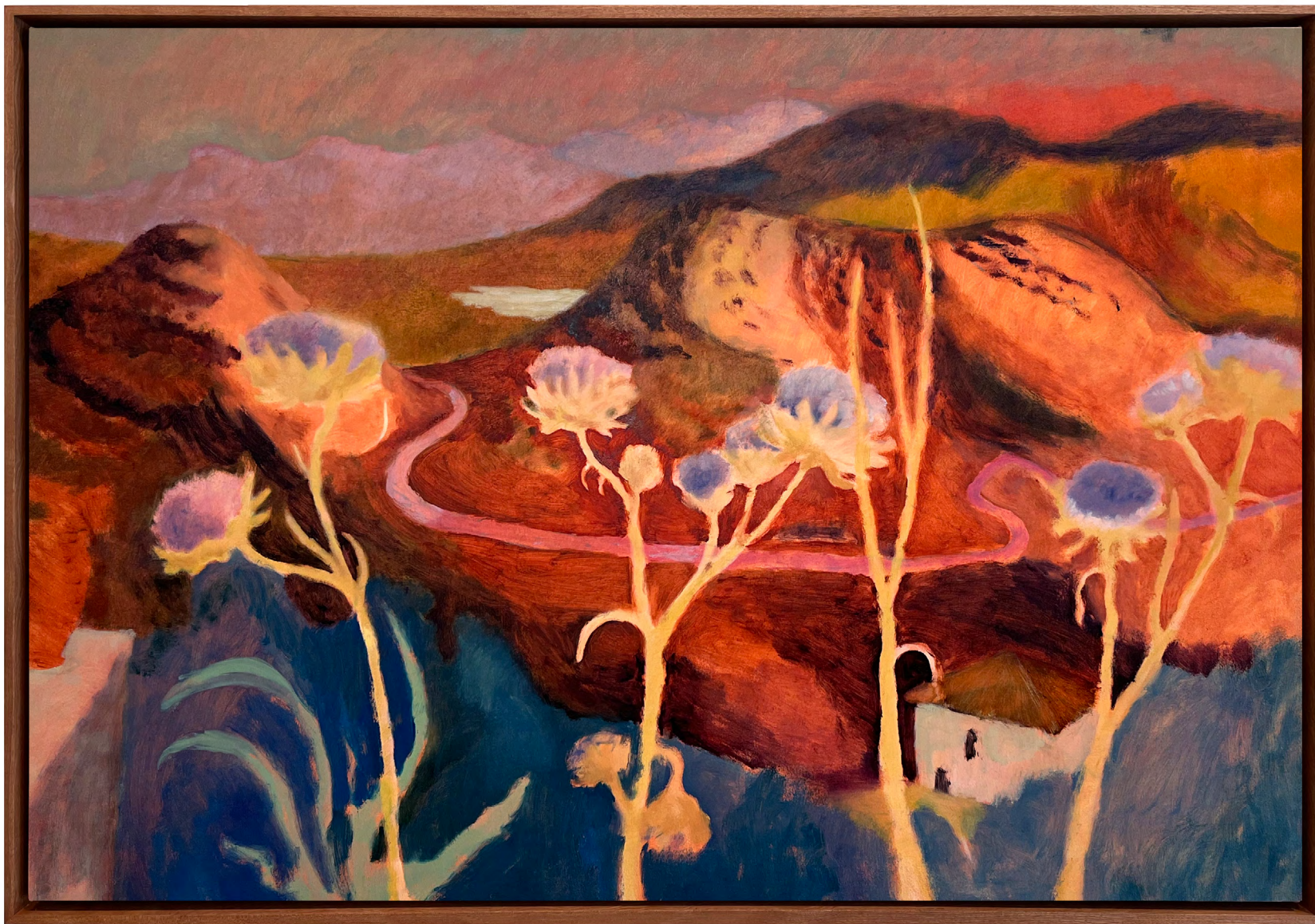
Artichokes at Dusk Oil on canvas 125 x 85 cm 2023 Framed in sapele SOLD