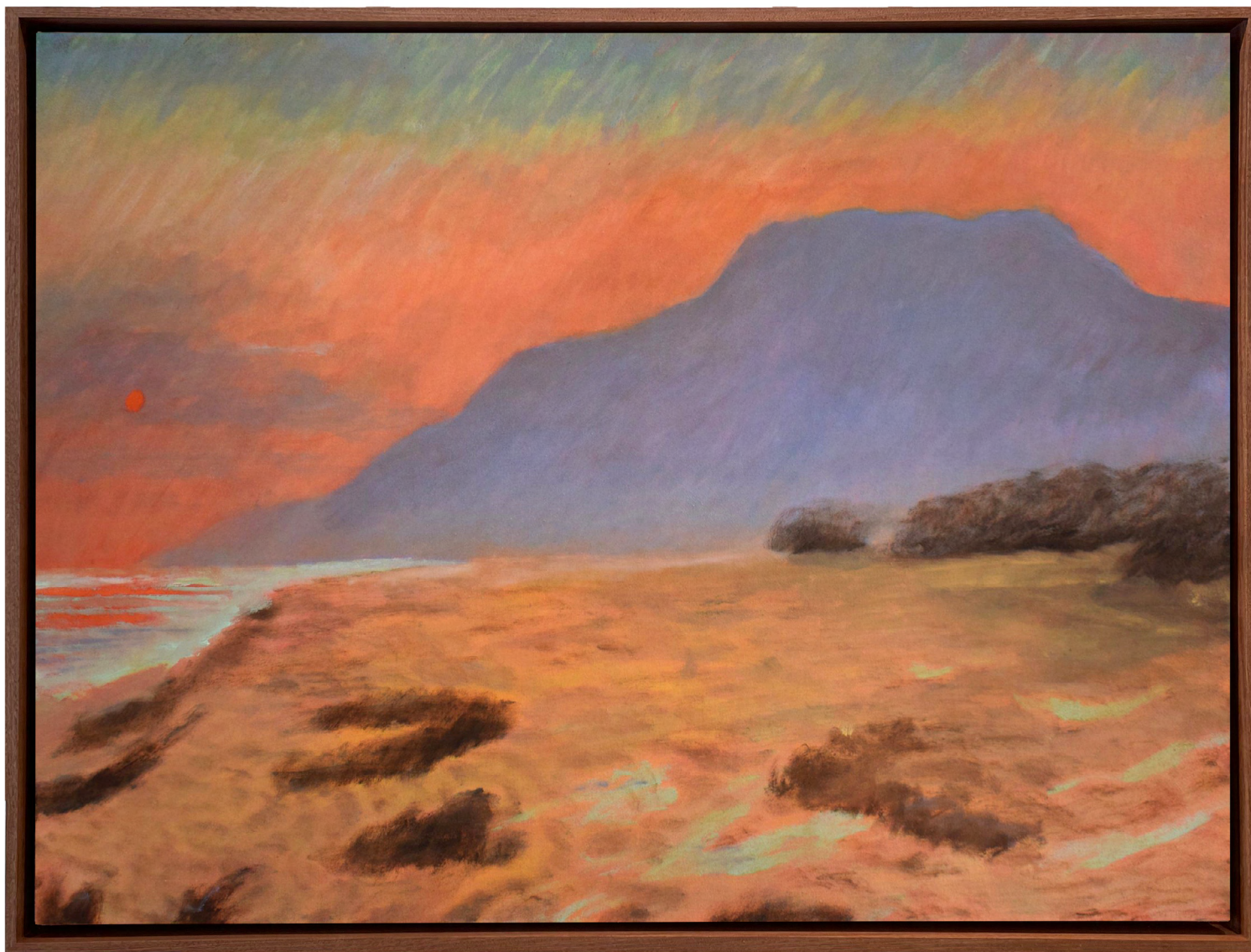
Losing Light Oil on canvas 100 x 75 cm 2023 Framed in sapele SOLD