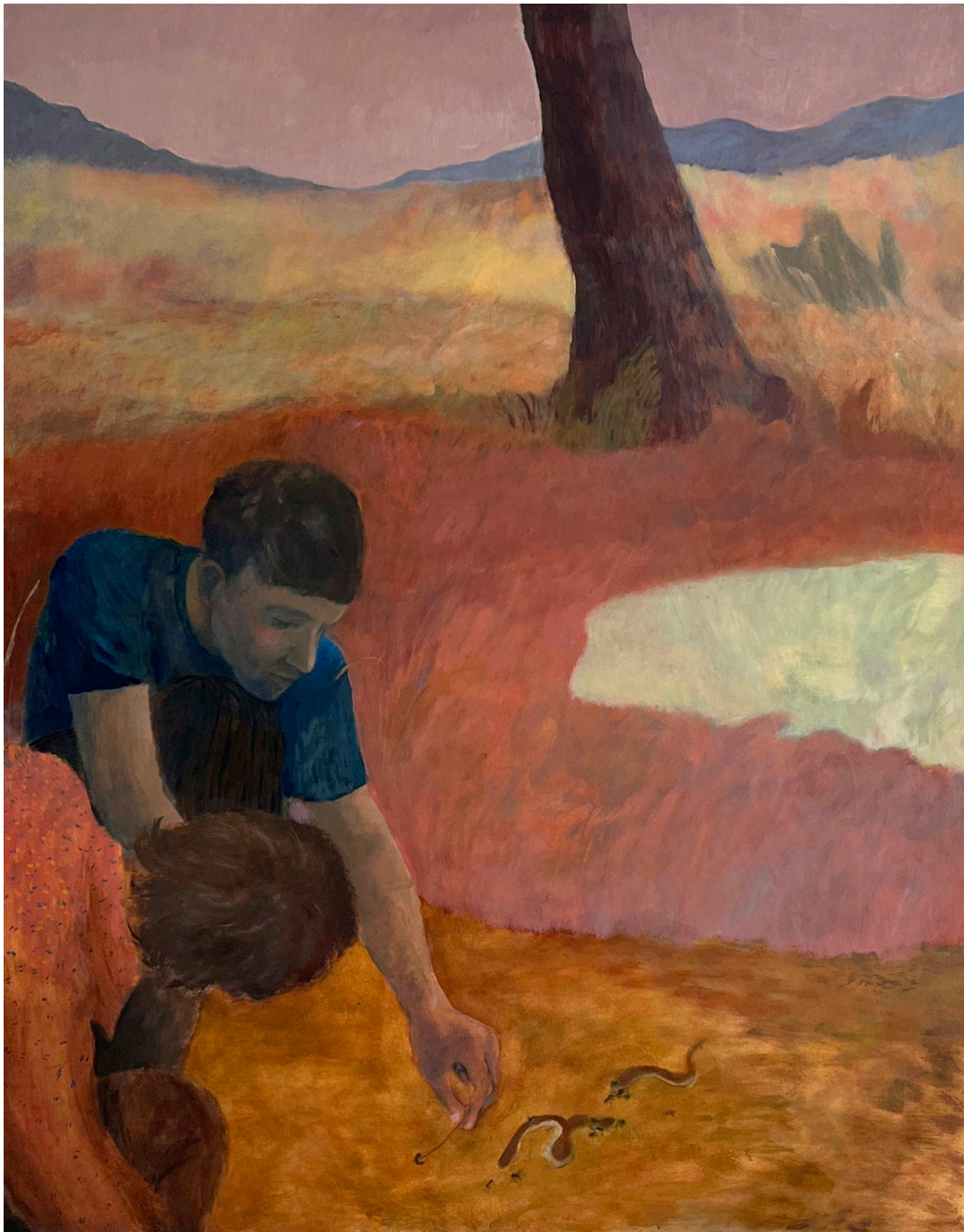
Out of the Ground Oil on canvas 120 x 150 cm 2023 £4,900