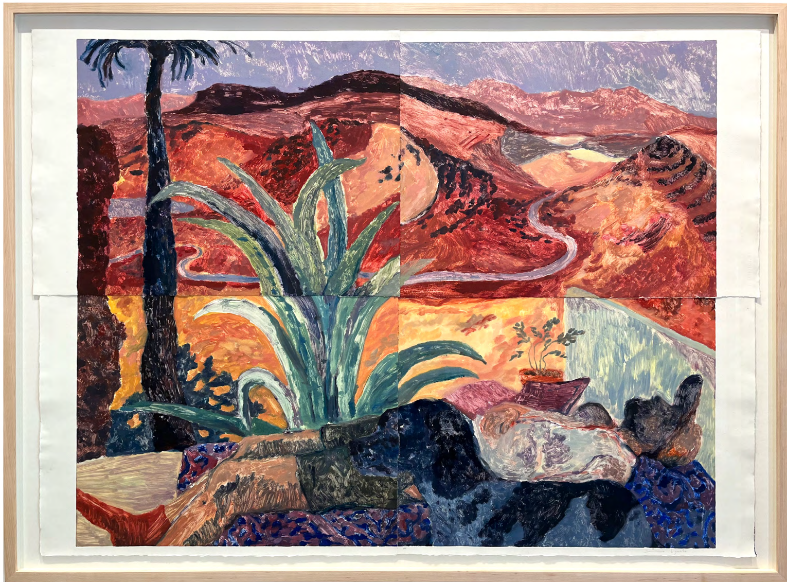
The Air Lay Heavy Monotype on Hahnemuhle paper 140 x 102 cm - unframed size 150 x 111cm - framed size 2022 Framed in maple SOLD