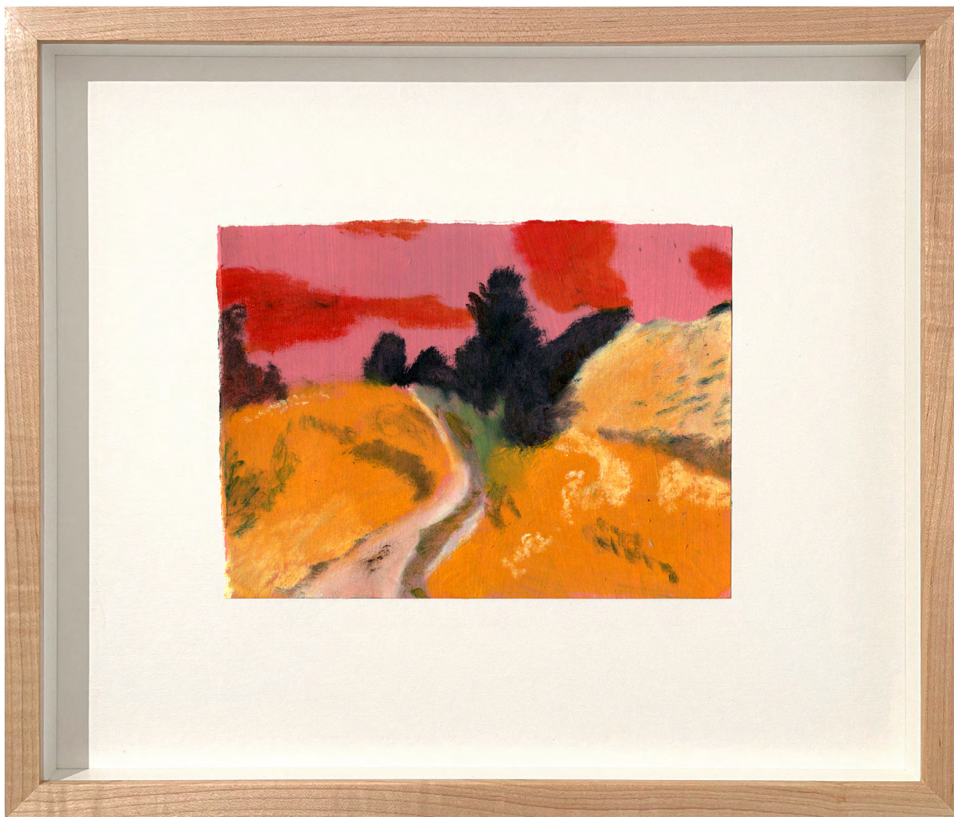
There was Time Pastel on paper 22 x 15 cm - unframed size 31 x 37 cm - framed size 2022 Framed in maple SOLD