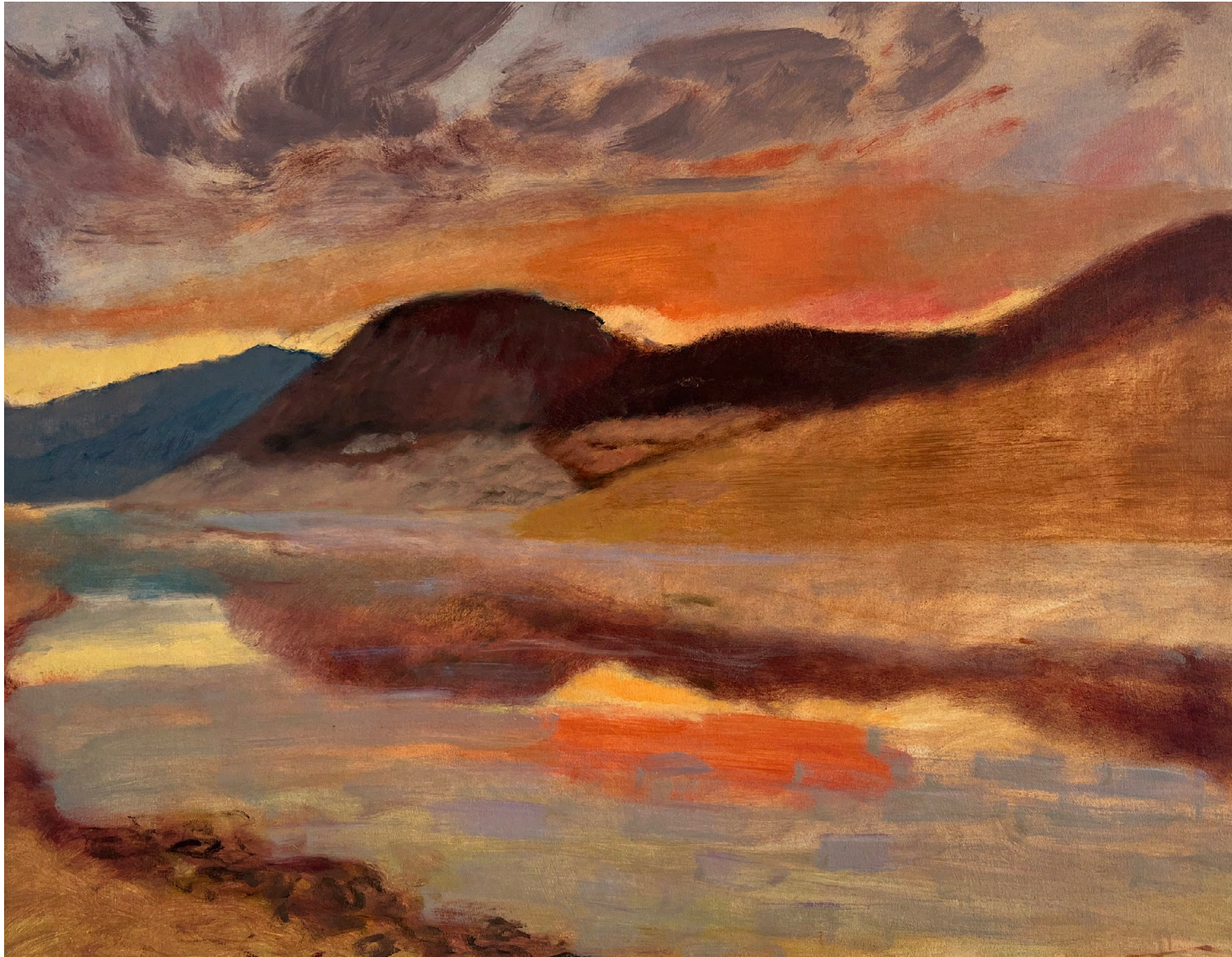
Lakeside Oil on canvas 97 x 77 cm 2023 SOLD