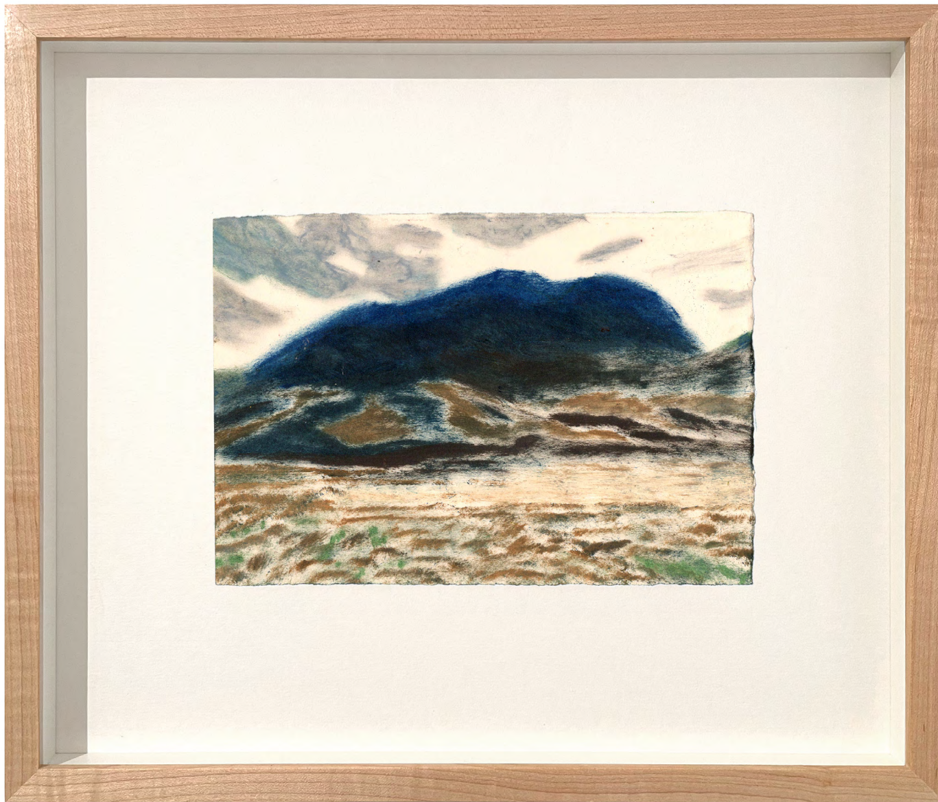
Blue Hill Pastel on paper 22 x 15 cm - unframed size 31 x 37 cm - framed size 2022 Framed in maple SOLD