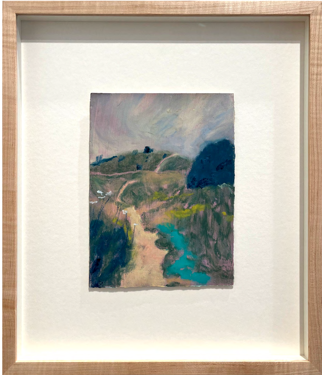
Over the Hills Pastel on paper 19 x 14.5 cm - unframed size 31 x 36 cm - framed size 2022 Framed in maple SOLD