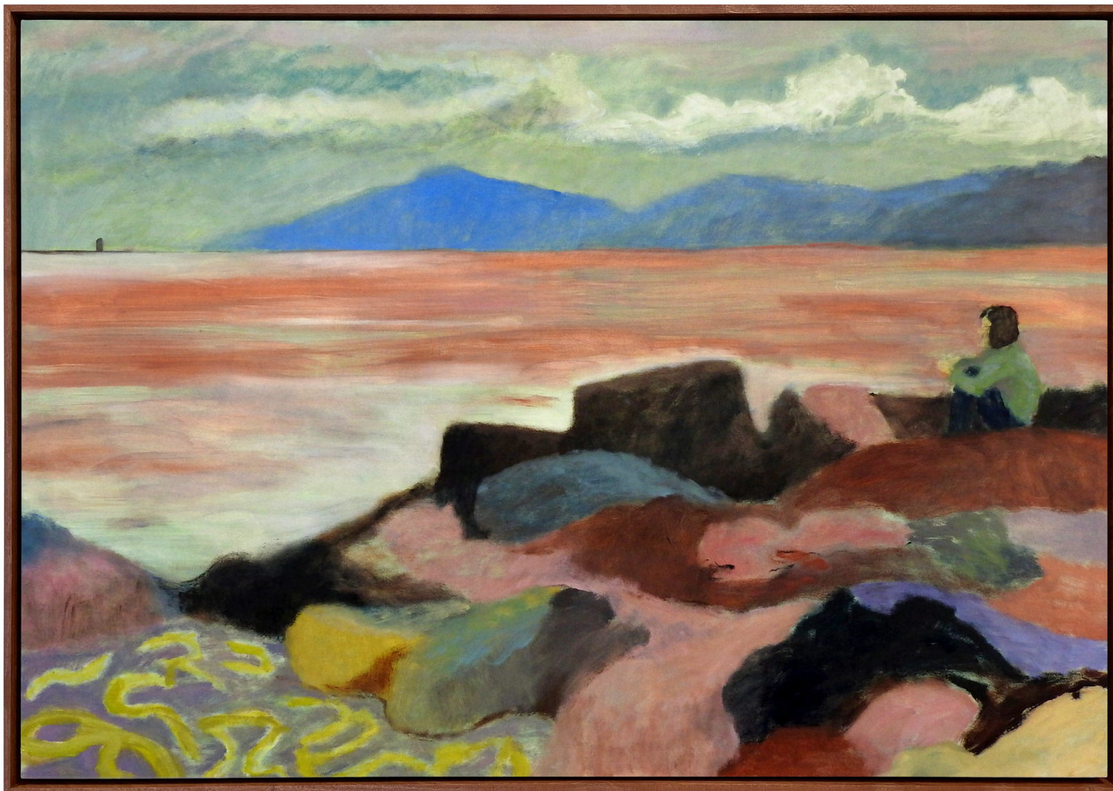
The Last Time We Swam