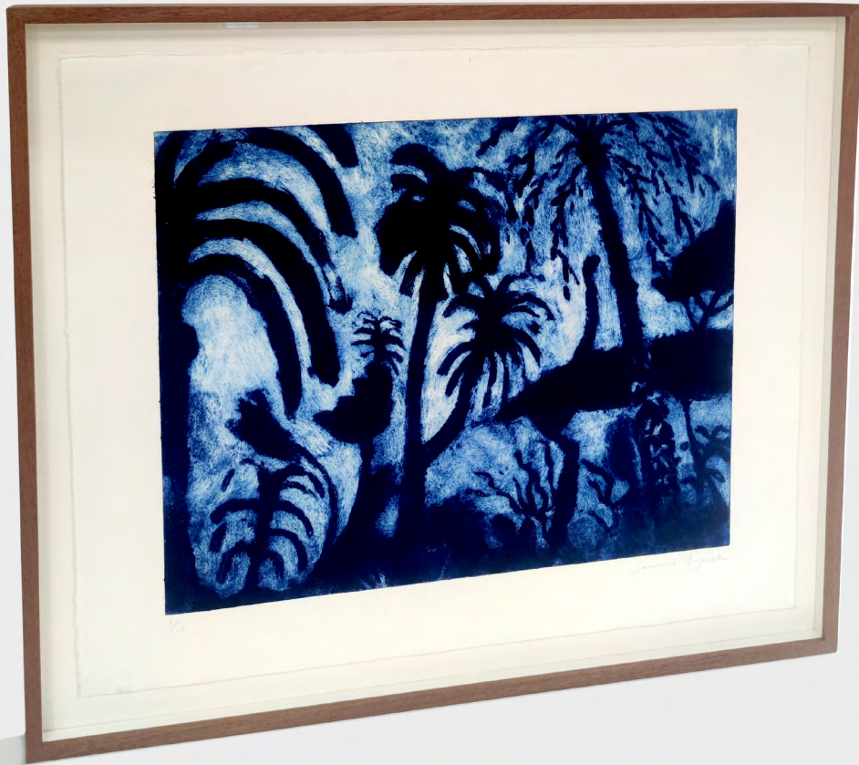
Blue Palms Carborundum 63 x 52cm - unframed size 72 x 60cm - unframed size Edition of 10 2022 Framed in sapele £690 unframed £930 framed (1/10)