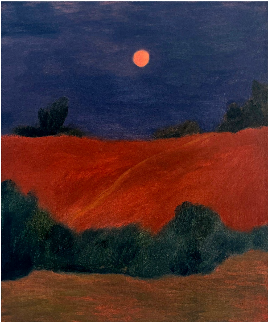
Moon at Dawn Oil on canvas 50 x 60 cm 2023 SOLD